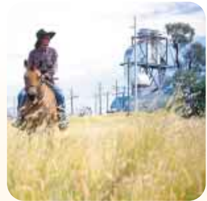
Located on the outskirts of Roma, Origin Energy's Roma Power Station helps meet the State's electricity demand during peak periods.